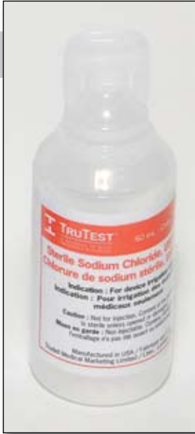
Sterile Sodium Chloride with a Twist Top!